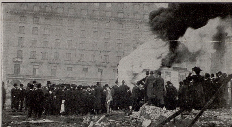
Shed, 18 ft. high, ablaze.